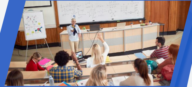
3. Hybrid Teaching Classrooms