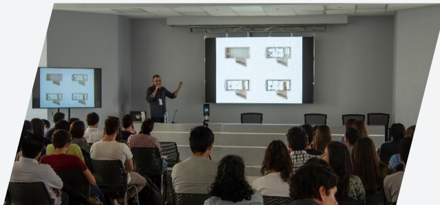
4. Seminar Rooms