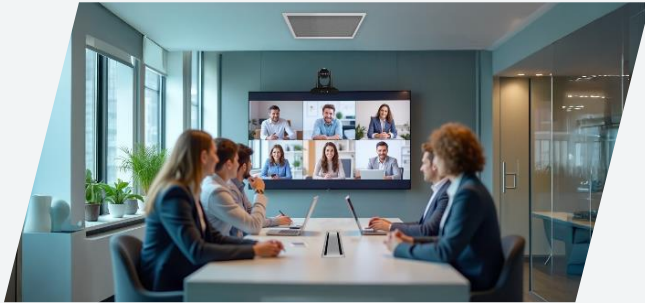
1. Medium Conference Rooms

As a leader in the AV market, Lumens provides business with high-quality video conferencing solutions. Invest in Lumens to improve employee productivity, lower travel costs, increase sustainability and enhance communication.