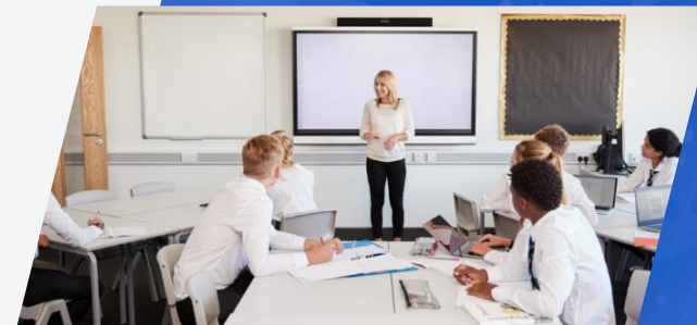
5. Multi-purpose Rooms