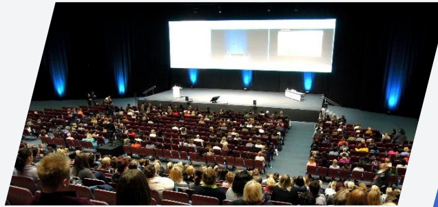
2. Lecture Halls