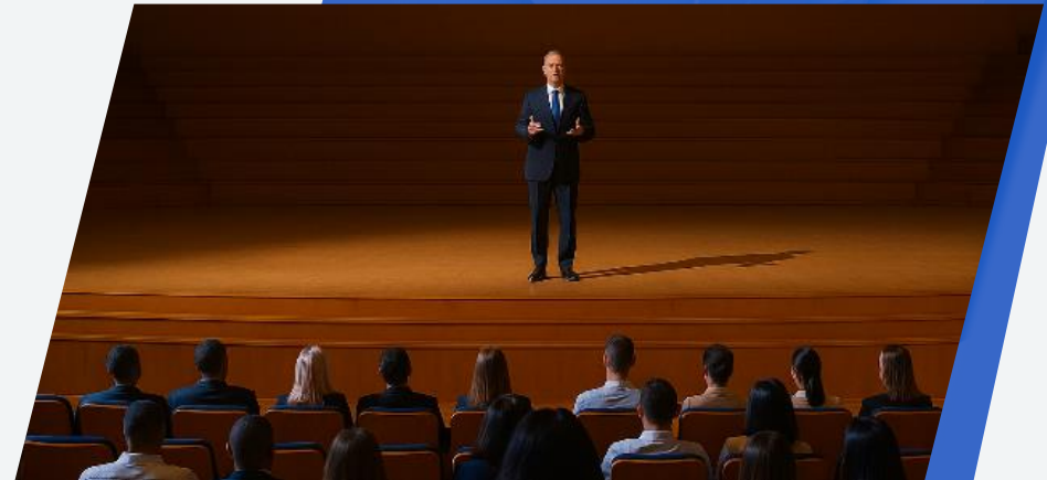
2. Seminar Rooms