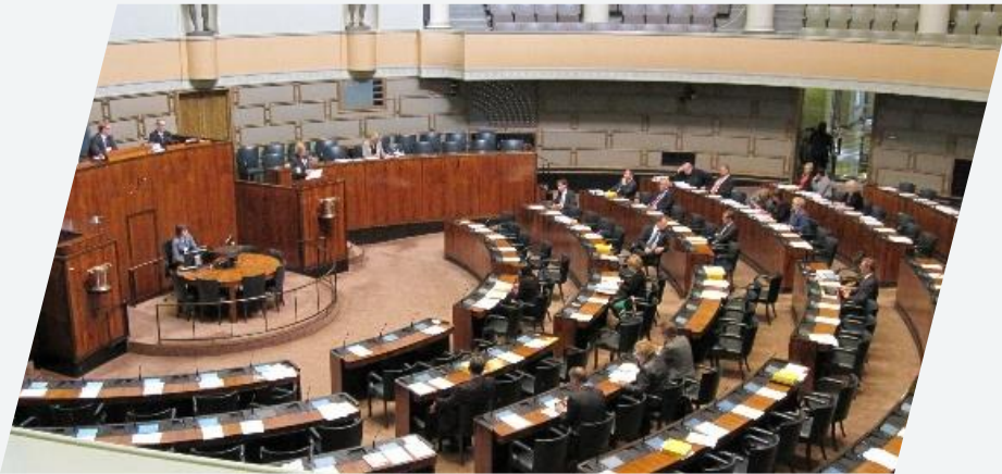
1. Conference Rooms

In an increasingly digital world, government organizations live broadcast interviews, public hearings and press conferences to audiences over the Internet. Lumens streaming solutions provide a great way to enhance political communication between the government and the citizens. It creates a media archive that can be made available for on-demand viewing.