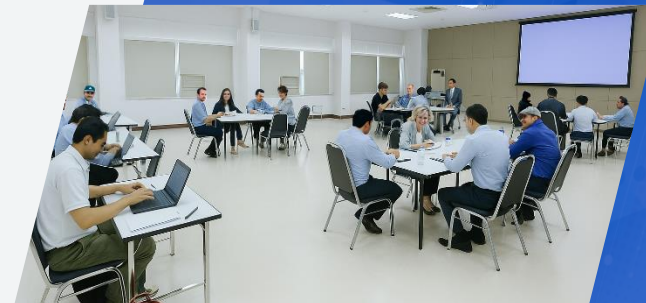
5. Multi-purpose Rooms