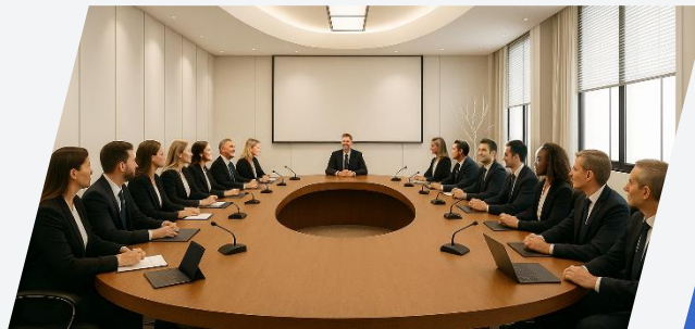
2. Large Conference Rooms