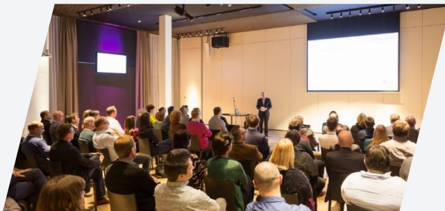
4. Training Rooms